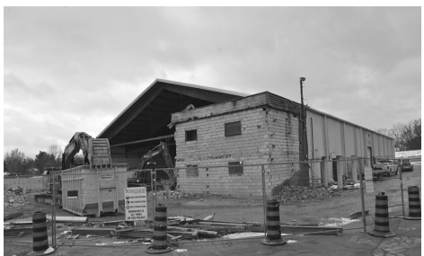
Construction of the Riverside Exhibition Centre-2018

In early 2020, the Riverside Exhibition Centre was completed. Though community fundraising goals were