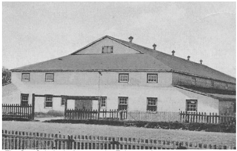
The first Caledonia Arena at the Fairgrounds.

During the Depression gates admissions were reduced from 50 cents to 25 cents. In 1935 receipts were so low that the fair could only initially pay 65 cents on the dollar. The fair also purchased Liability Insurance for the first time in 1936.