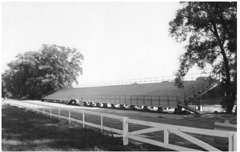
The New Grandstands- 1962

In 1961 the main entrance to the Arena was modernized. The Exhibition Hall became the showcase of the