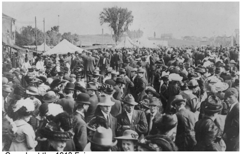
Crowds at the 1913 Fair

At the Annual Meeting in 1912 the President declared that the "society is in a very flourishing condition" with assets totalling $8117. Several items of interest appear in the Minute Book during this decade. Ribbons were used in place of cards for awards in the livestock classes. The Grounds Committee was granted $700 to improve the track and $500 to erect new horse stalls at the east end of the grounds. Hydrants were installed opposite the grounds for fire protection and attendance turnstiles were purchased. In 1915 a secretary's and