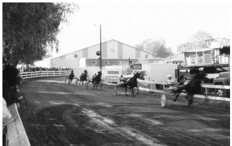
Harness Racing with New Arena in background

Centennial features included an antique parlour and kitchen, antique school supplies and a Spelling Match. All directors wore period costume. Once again, plans were defeated by the weather. Continuous rain forced the cancellation of the horse shows, races and night shows. However it was reported that "over 12,000 loyal people braved the elements clad in every type of raincoat and rubber footwear imaginable."