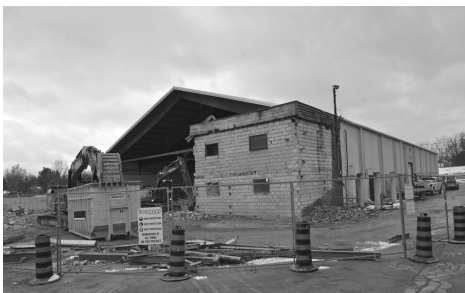
Construction of the Riverside Exhibition Centre— 2018

In early 2020, the Riverside Exhibition Centre was completed. Though community fundraising goals were