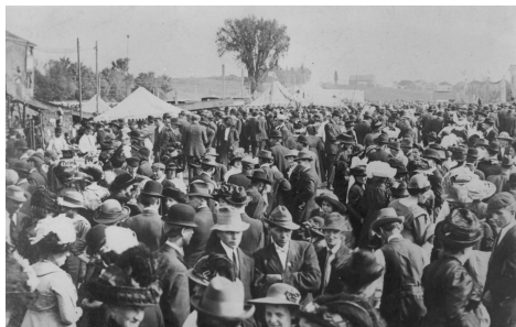
Crowds at the 1913 Fair

At the Annual Meeting in 1912 the President declared that the "society is in a very flourishing condition" with assets totalling $8117. Several items of interest appear in the Minute Book during this decade. Ribbons were used in place of cards for awards in the livestock classes. The Grounds Committee was granted $700 to improve the track and $500 to erect new horse stalls at the east end of the grounds. Hydrants were installed opposite the grounds for fire protection and attendance turnstiles were purchased. In 1915 a secretary's and