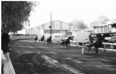
Harness Racing with New Arena in background

Centennial features included an antique parlour and kitchen, antique school supplies and a Spelling Match. All directors wore period costume. Once again, plans were defeated by the weather. Continuous rain forced the cancellation of the horse shows, races and night shows. However it was reported that "over 12,000 loyal people braved the elements clad in every type of raincoat and rubber footwear imaginable."