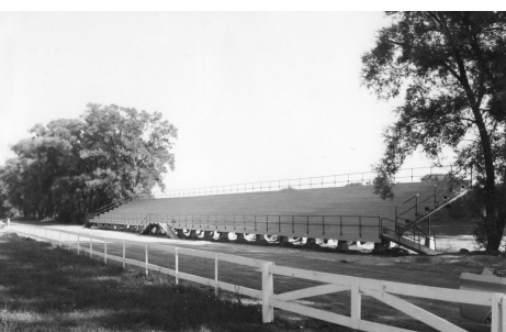
The New Grandstands— 1962

In 1961 the main entrance to the Arena was modernized. The Exhibition Hall became the showcase of the