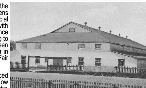
The first Caledonia Arena at the Fairgrounds.

Fair and 1800 new royal blue and gold streamers were suspended from the ceiling. Nearly a quarter of a mile of red, white and blue bunting and five truck loads of autumn leaves decorated the exhibits. Lady Directors wore new wine coloured blazers and the Men Directors sported tan coloured, ten gallons hats.