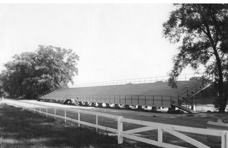
The New Grandstands— 1962

In 1961 the main entrance to the Arena was modernized. The Exhibition Hall became the showcase of the Fair and 1800 new royal blue and gold streamers were suspended from the ceiling. Nearly a quarter of a mile of red, white and blue bunting and five truck loads of autumn leaves decorated the exhibits. Lady Directors wore new wine coloured blazers and the Men Directors sported tan coloured, ten gallons hats.