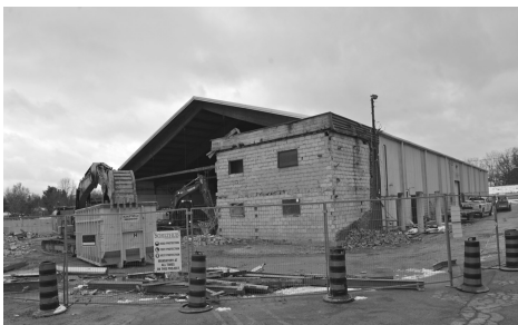
Construction of the Riverside Exhibition Centre— 2018