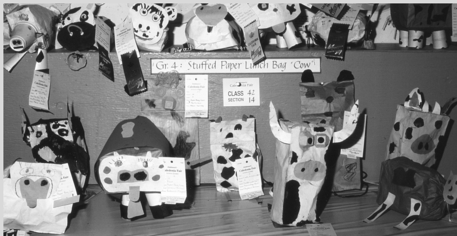
Photo: Grade 4 Entries in the 1995 School Department— paper lunch bag cows.

A bonus prize for the school with the most points in the School Department was started in 1993. Oneida Central has held this honour for the past 25 consecutive years!