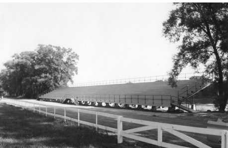
The New Grandstands— 1962

In 1961 the main entrance to the Arena was modernized. The Exhibition Hall became the showcase of the Fair and 1800 new royal blue and gold streamers were suspended from the ceiling. Nearly a quarter of a mile of red, white and blue bunting and five truck loads of autumn leaves decorated the exhibits. Lady Directors wore new wine coloured blazers and the Men Directors sported tan coloured, ten gallons hats.