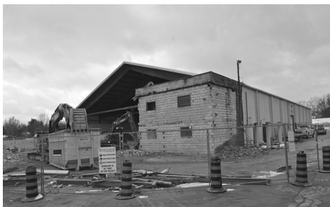
Construction of the Riverside Exhibition Centre—2018

In early 2020, the Riverside Exhibition Centre was completed. Though community fundraising goals were