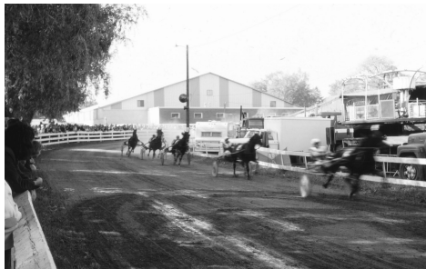
Harness Racing with New Arena in background

Centennial features included an antique parlour and kitchen, antique school supplies and a Spelling Match. All directors wore period costume. Once again, plans were defeated by the weather. Continuous rain forced the cancellation of the horse shows, races and night shows. However it was reported that "over 12,000 loyal people braved the elements clad in every type of raincoat and rubber footwear imaginable."